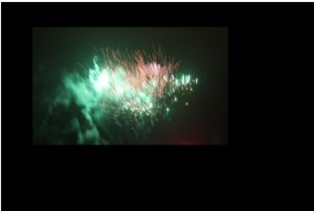
Explosion in the sky (Bonfire Night)

Autumn is truly with us, what a spectacular sight Mother Nature gives us each year, just waiting to be captured on camera. Perhaps like many of us, I simply cannot believe November is almost gone and Christmas is just a matter of a few weeks away. Before all those festive activities get underway, the month of November has really been a busy one, which has provided many photographic opportunities. The first that springs to mind, that fella called Guy Fawkes and a few of his mates, who in 1605 armed with 36 barrels of gun powder tried to blow up the Houses of Parliament, and over throw King James I. He paid a high price for that deed, very much as we do for Fireworks nowadays.