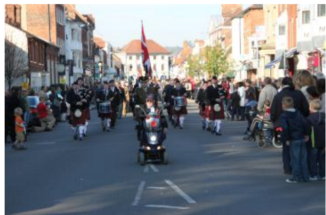
Remembrance Day Parade