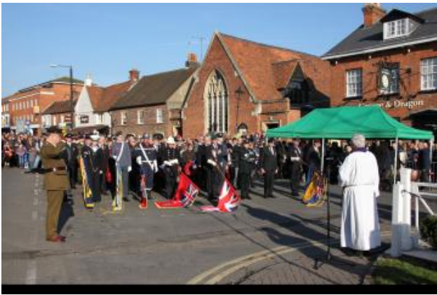
Remembrance Day War Memorial Service