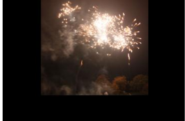
Photo's taken at local Bonfire Night