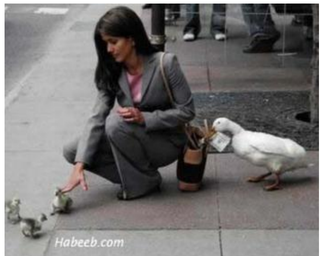
Watch out there's a thief about