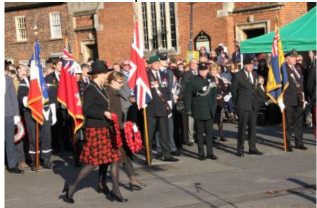
Remembrance Day War Memorial Service

Sunday 13 th Marlow Remembrance Day Parade and War Memorial Service. The event is believed to have drawn the largest number of spectators on record. Truly a well-organised Remembrance Day that Marlow should be proud of.