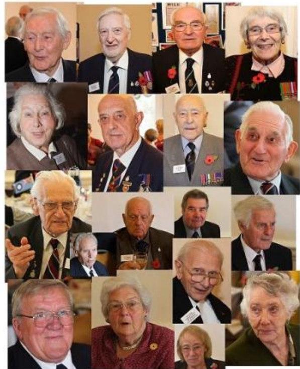
Veterans Lunch Gathering

As one MCC member was heard to remark, to be in such company, truly a humbling experience.